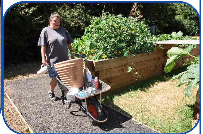
Community Garden—Anniversary Celebration